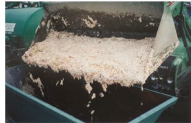
The waste is loaded into the hopper above the pump ...

Please visit www.seepex.com for further information and contacts.