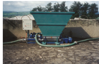
... and transported into a mobile soil injection unit by a seepex BTI range pump.