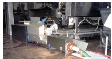
seepex pump installed underneath conveyor, receiving fish waste from filleting machines.