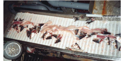
Heads, tails and frames from filleting machines.

As a result, Gallagher Brothers have not only reduced the amount of water to be treated but have also reduced significantly the BOD level in the water treatment plant. And they have reduced their overall costs. What is more, further orders have now been received from two other fish processing plants in Killybegs.