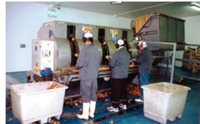
Onions being placed into peeling machine.