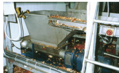
seepex BTM range pump installed underneath onion peeling conveyor, receiving waste onions and peels.