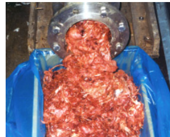
... and after chopping and conveying.