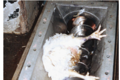
Chicken before ...

The system it replaced had been expensive to maintain, incurring higher costs in terms of energy, maintenance, spare parts and down-time. It had also made the adding of dyes to indelibly stain waste meat a separate operation, something now easily handled by the seepex pumps.