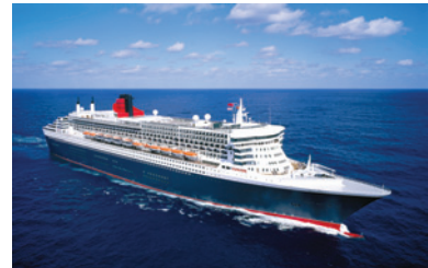
Ocean Liner Queen Mary II

Since there is little room below the decks of a passenger ship, the modular design is particularly popular with the plant builders / installers. Instead of many individual units only a few plant parts need to be brought in for installation at close quarters. So, passengers can sail the seven seas with a clear conscience knowing they are on an environmentally friendly and energy efficient vessel that works in perfect harmony with its surroundings.