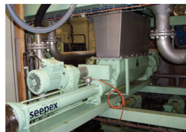
seepex pump of range BTI for conveying dewatered sludge into the drier