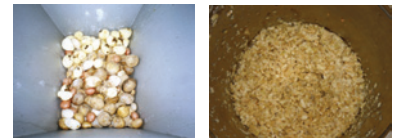
Potatoes before and after macerating and transportation.