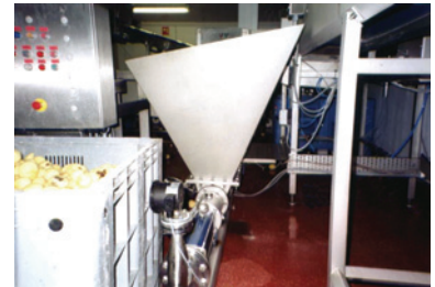
seepex BTM range pump with open hopper.

As the site project engineer commented. "Now we hardly have to handle the waste at all - and we've got a closed pipeline system instead of our open conveyors. What a truly smashing idea!" The seepex system has also brought them less mechanical break-downs and a reduction in the bulk of the waste through the particle size being reduced, so lowering the overall cost of waste disposal.